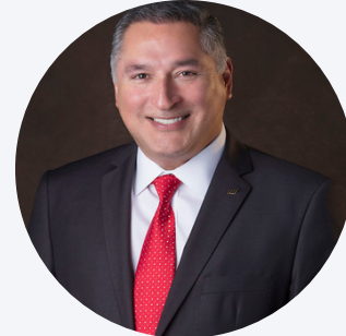
Mayor Javier Villalobos Ex-Officio Member/Mayor